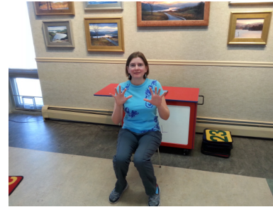
Sing along with a fingerplay.