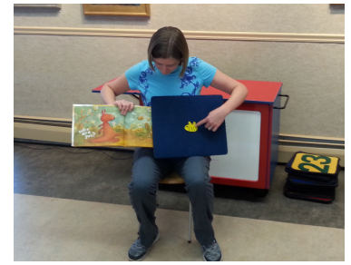
Match your flannel piece to the story.