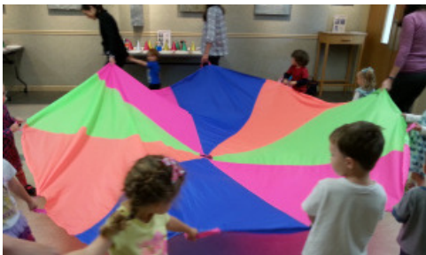
Hold the edge of the parachute and listen for instructions.