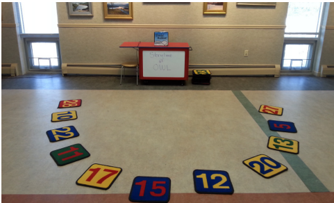
Sit down on a mat.

This is a visual schedule of a preschool storytime. To help your child transition to the next activity, point to the picture and describe what activity will happen next.