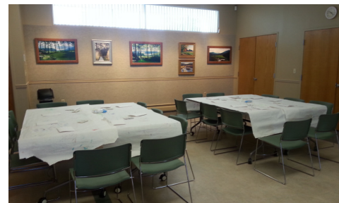
Choose a seat for craft time.