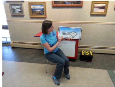
Listen to a story.