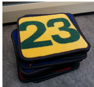
Stack your mat in the pile.